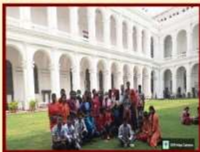
Educational tour to Indian Museum