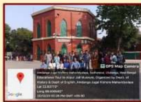
Educational tour to Alipuri Jail Museum