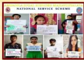
Covid Awareness Programme