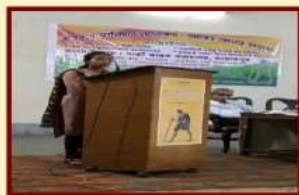
State-level Seminar in Gandhi Smarak Sangrahalay