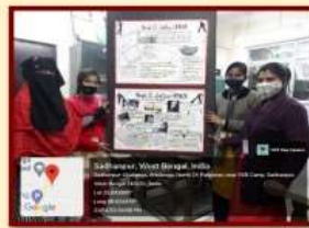
Publication of Wall-Magazine